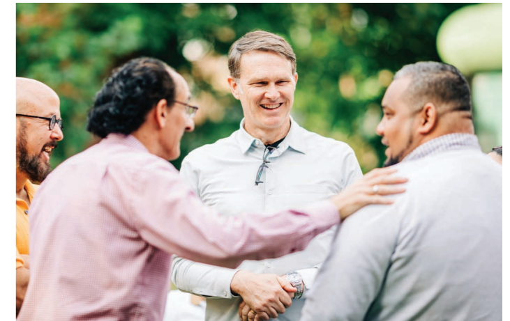
LATIN UNITY EVENT: OUR UNITY EVENT GEARED TOWARD SPANISH SPEAKERS BROUGHT TOGETHER LEADERS OF CHURCHES FROM THE SPANISH AND PORTUGUESE-SPEAKING COMMUNITIES IN MANCHESTER, LIVERPOOL, AND BIRMINGHAM. THE LOCAL PASTORS WERE PASSIONATE AND IN AGREEMENT ABOUT THE NEED FOR UNITY ACROSS THE CHURCH AND FULL OF FAITH, TRUSTING A MOVE OF GOD ON THE HORIZON.