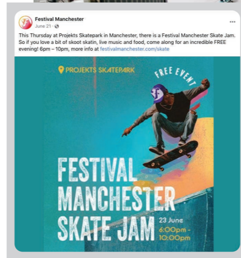
SKATE OUTREACH: AN EVENING OF FREESTYLE SKATE SESSIONS, PLENTY OF PIZZA AND DRINKS, AND LIVE MUSIC LED TO ONE OF THE BAND MEMBERS SHARING HIS TESTIMONY ABOUT THE TRUE AND LASTING HOPE THAT JESUS OFFERS TO THE GROUP OF ABOUT 75 PEOPLE WHO HAD GATHERED.