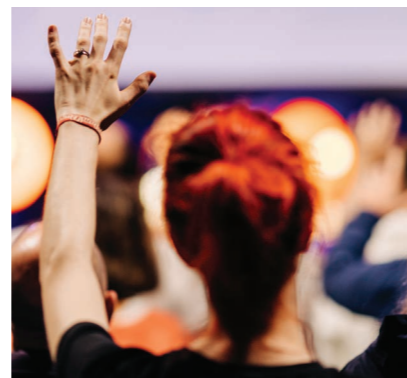
STREET PARTY: HOSTED BY THE MESSAGE TRUST, THE EVENING LED TO OLYMPIAN ABIGAIL IROZURU SHARING HER TESTIMONY, IN PARTICULAR ABOUT HOW FOLLOWING JESUS IMPACTS HER APPROACH TO TRAINING AND COMPETING, AND WENDY SHARING THE GOSPEL, WHERE MANY WOMEN RESPONDED TO THE GOOD NEWS.